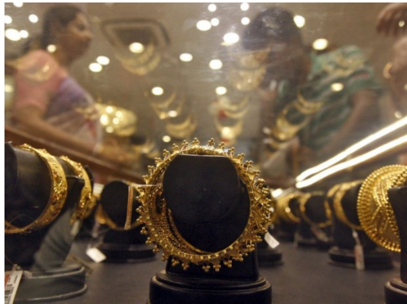
In this file photo, Gold bracelets are on display as a woman (L) makes choices at a jewellery showroom on the occasion of Akshaya Tritiya, a major gold buying festival, in Kolkata.

Ad 2 & 3 BHK in Bangalore Ready-possession homes from 74 Lac* with limited period flexi pay plan salarpuriasattvacelesta.com